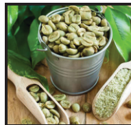
GREEN COFFEE BEANS