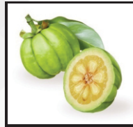
GARCINIA CAMBOGIA HCA